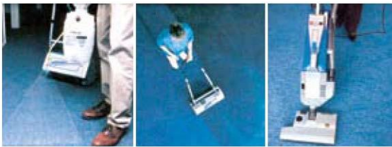
A pre-spray and neutralizing rinse combina-

Recommended Equipment & Chemicals: U.S. Products (Cobra Plus Series)